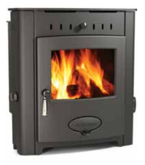
Ecoboiler 16 HE Inset | 16.1kW A