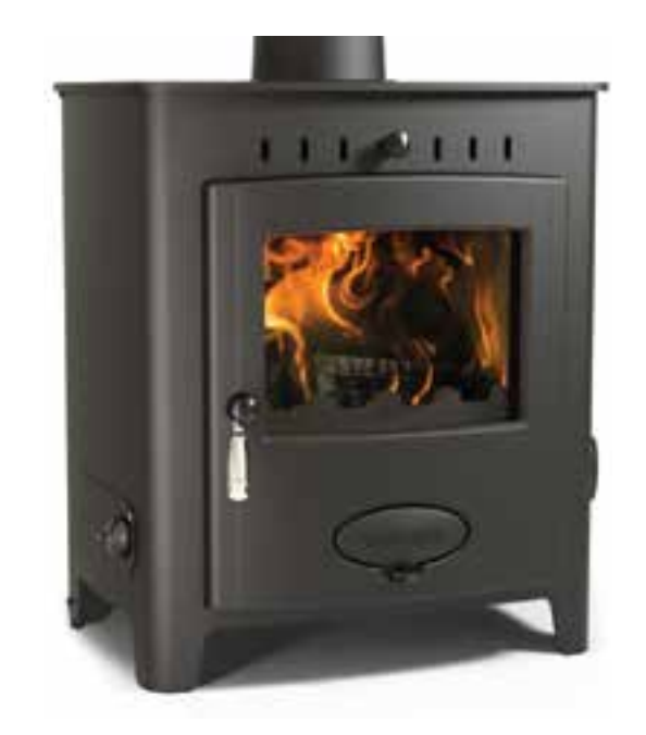
Ecoboiler 12 HE | 12.1kW A

Available with 9, 12.1, 13.6, 18 or 22.5kW outputs