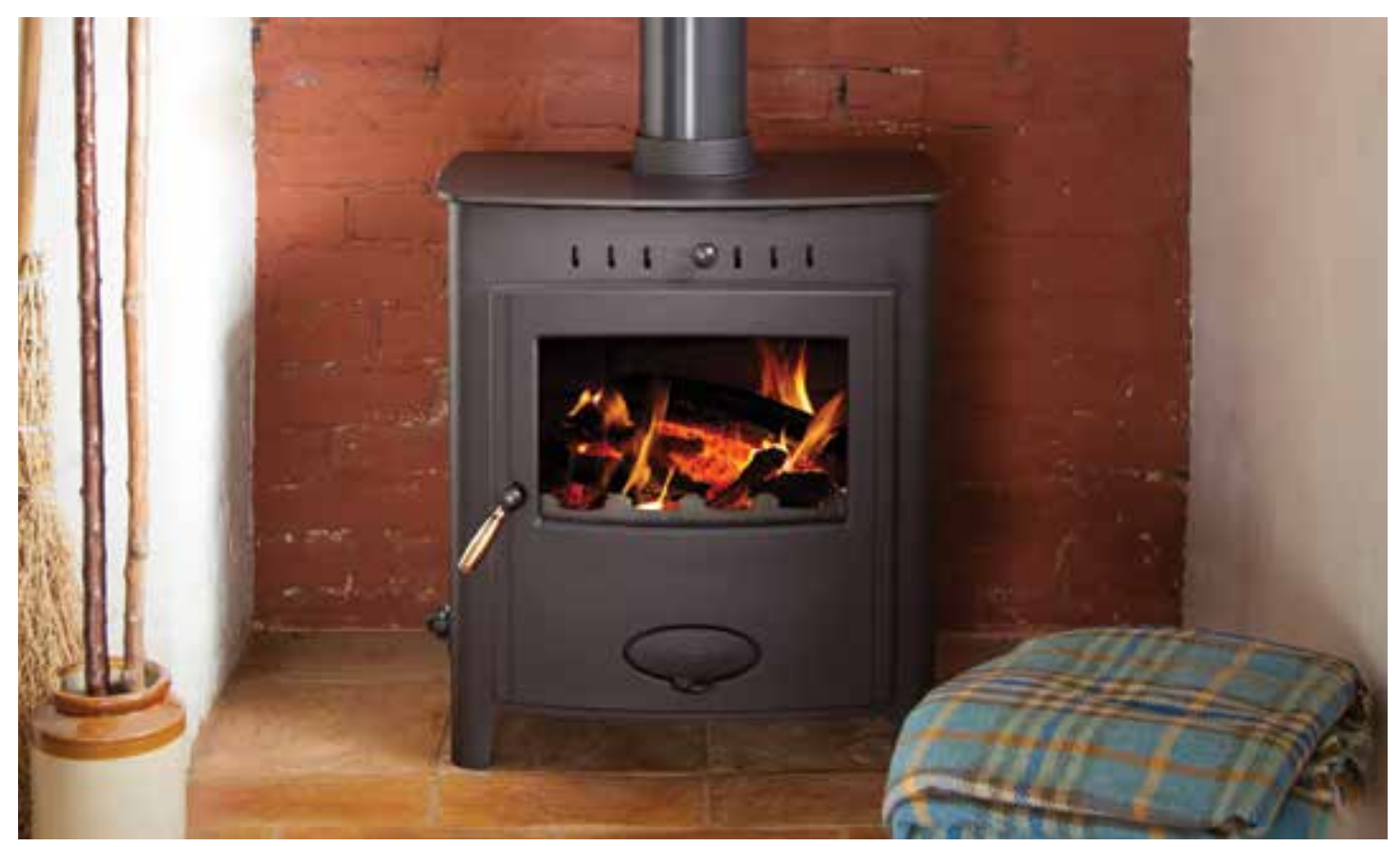
Model shown: Ecoboiler 16 HE | 13.6kW

Providing more than just superior performance, the Ecoboiler HE (high efficiency) has a large fire door glass and soft curved lines, offering an attractive focal point for any living area. On top of its stylish appearance, discreet thermostatic control and three bar operating pressure, its ability to produce 50% more heat to water than other boiler stoves ensures the Ecoboiler is the ultimate heating companion.