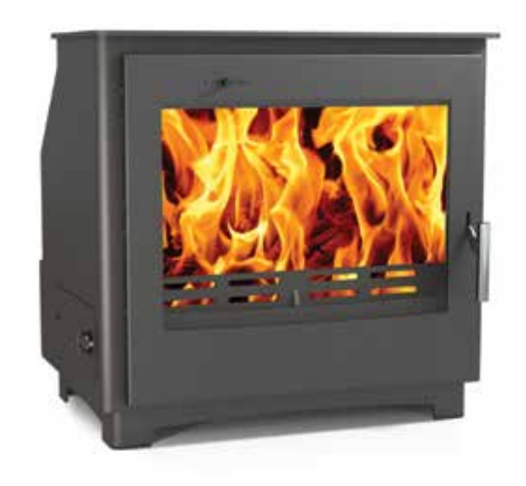
Ecoboiler Wood | 11.8kW A