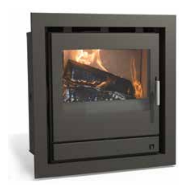
Ecoboiler 12 Cassette | 11.8kW